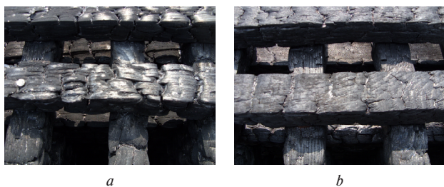
Fig. 2. Photo of quenching model fires “1A” class after the suppression by: a – water; b – PHMG-CP

In Fig. 2. there is a photo of quenching model fires “1A” class after the suppression by water (a) and PHMG-CP (b).